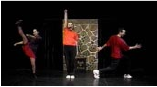
Rock 'N' Fables

Really Little Theatre is a professional theatre for young audiences which has been thrilling young audiences and their families since 1991. It is their unique blend of theatre, music, storytelling, dance, puppetry, mime and comedy that has made them a very popular choice for schools and theatres not only in Canada, but abroad as well.