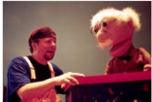
Tales of Ti-Jean

Travellin' The World , performing in theatres and schools in France, Belgium, The Netherlands, Luxembourg and Germany. Their musical recording, Show (And Tell) Tunes was such a hit that it led to the forming of the Show & Tell Band, touring Ontario from 1995-1998.