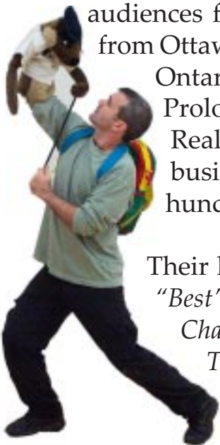
I Heard A Story