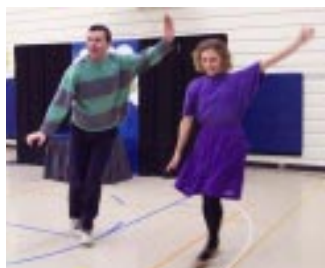
The Holiday Dream

Travellin' The World , performing in theatres and schools in France, Belgium, The Netherlands, Luxembourg and Germany. Their musical recording, Show (And Tell) Tunes was such a hit that it led to the forming of the Show & Tell Band, touring Ontario from 1995-1998.