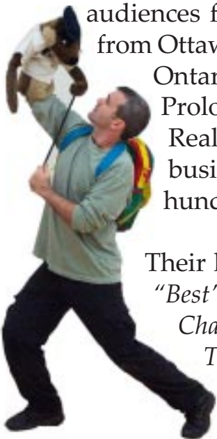
I Heard A Story