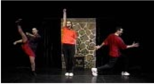
Rock N' Fables

Really Little Theatre is a professional theatre for young audiences which has been thrilling children and their families since 1991. It is their unique blend of theatre, music, storytelling, dance, puppetry, mime and comedy that has made them a very popular choice for schools and theatres not only in Canada, but abroad as well.