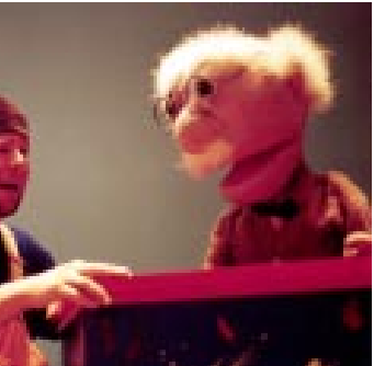
Tales of Ti-Jean

Their hit shows over the years have included “Best”, Tall Tales , The Wish , Travellin’ The World , Charlie’s Friends , MORE! , World Travellin’ , The Holiday Dream , Tales of Ti-Jean , Travellin’ Stories , I Heard A Story and the pop-opera Rock N’ Fables . In addition to touring across Canada, Really Little Theatre has done three international tours of Travellin’ The World , performing in theatres and schools in France, Belgium,